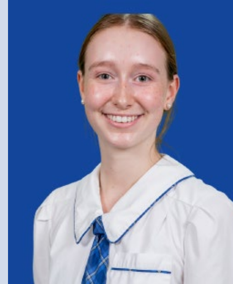
DUX: 99.95 QCE Distinguished Achiever UQ Scholarship