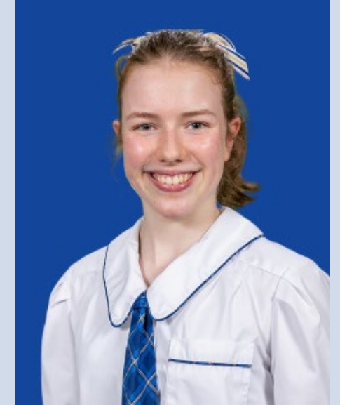
DUX: 99.95 UQ Scholarship