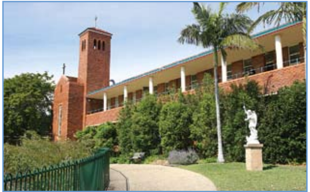
LORETO COORPAROO (EST. 1928)