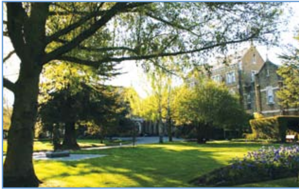
LORETO BALLARAT (EST. 1875)