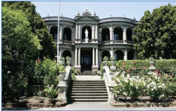
LORETO TOORAK (EST. 1924)