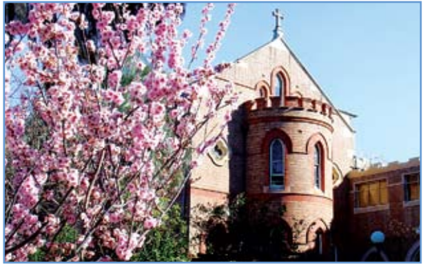
LORETO NORMANHURST (EST. 1897)