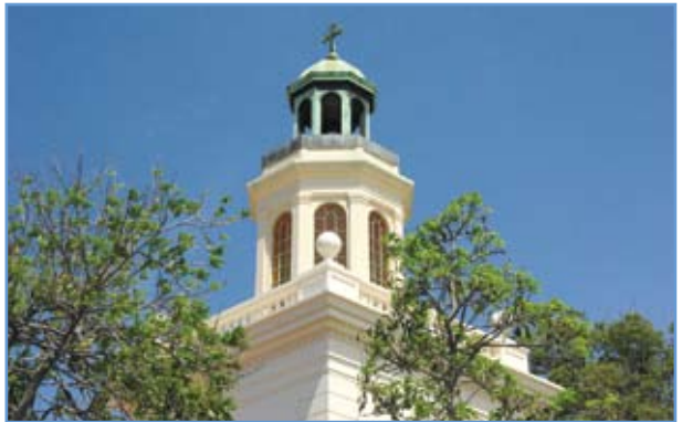
LORETO KIRRIBILLI (EST. 1908)