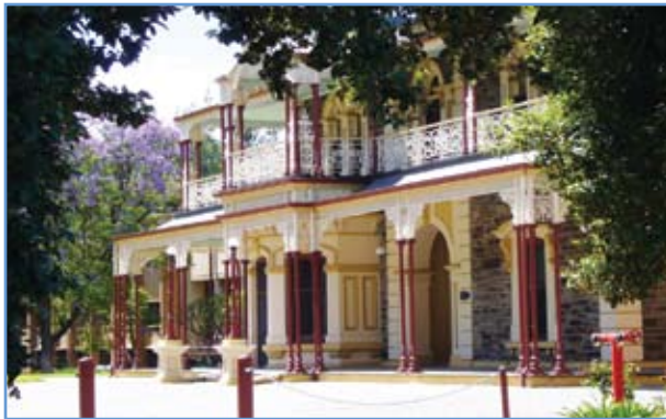
LORETO MARRYATVILLE (EST. 1905)