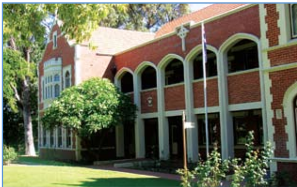
LORETO NEDLANDS (EST. 1931)